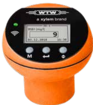
Oxitop®-IDS For all applications except biogas

The new OxiTop®-IDS is a modern measuring instrument for all kinds of respirometric studies. Regardless whether aerobic or anaerobic examinations, because of its versatility the OxiTop®-IDS is suited for both. All heads can be used independently from any meter for normal BOD measurements between one and seven days.