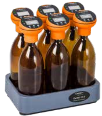
OxiTop®-IDS Set IS6

All measurements with the OxiTop®-IDS can be documented with a data acquisition program (download from www.wtw.com ) using the USB interface of the meter.