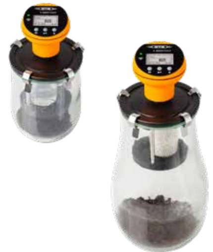
OxiTop®-IDS B6M 2.5 for AT4 tests