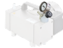
(Pump MPC 301 Z shown with dial gauge 700458)