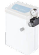
(Pump MPC 105 T shown with dial gauge 700459)