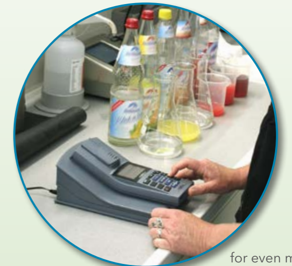
LabStation for even more comfort