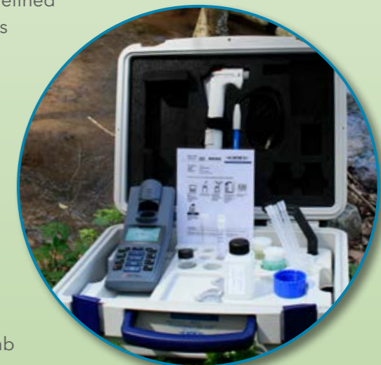
Field Sets: the mobile lab