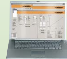
LSdata -Software for • GLP-compliant data management • Programming of user-defined programs