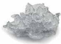
EF 127 Flake ice Residual water content 25%