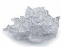
AF 127 Flake ice Residual water content 25%