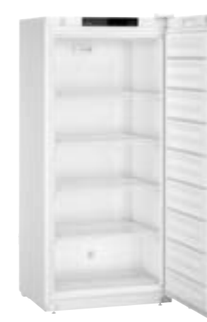
SFFsg 5501 Performance