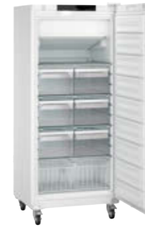
SFFvh 5501 Perfection

Liebherr refrigerators and freezers specially developed for storing temperature-sensitive products are CE safety-compliant. This ensures that all mechanical and electrical requirements for injury-free operation are met – and that you and your team are always safe.