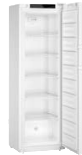
SFFsg 4001 Performance