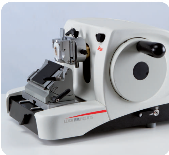
3. Leica RM2125 RTS manual microtome with PowerBase stability