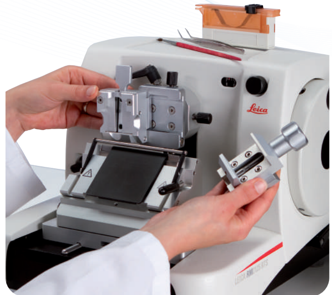
4. Quick exchange specimen clamp