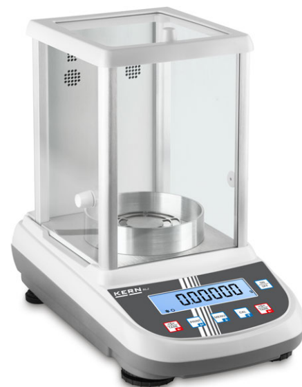
1 KERN ALJ 200-5DA with optional ionisor 2, see Accessories

Analytical balance range with large weighing capacities – now also with EC type approval [M] or available as semi-micro analytical balance