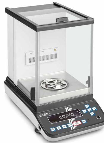
2 KERN ABP 100-5DM with optional ioniser

Premium analytical balance with the latest Single-Cell Generation for extremely rapid, stable weighing results - now also as a version with automatic sliding doors