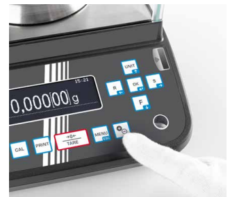
Ioniser (included) can be activated at the touch of a button