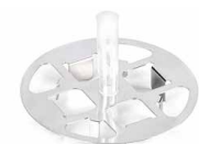
Multi-function weighing plate, Note: included with delivery for models with [d] = 0,01 mg