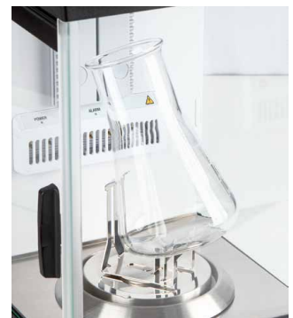
Erlenmeyer piston holder, included as standard with ABP 200-5M and ABP 200-5AM