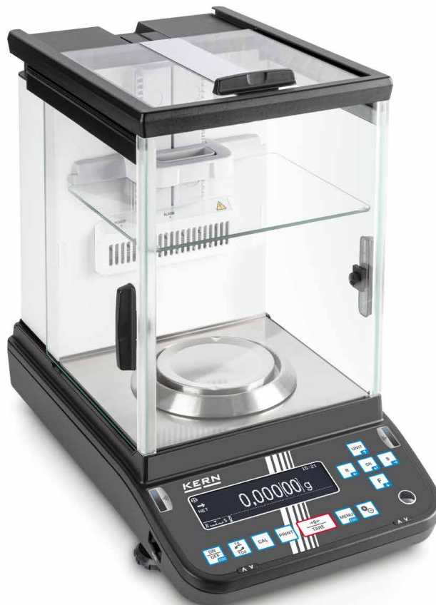
KERN ABP-A with integrated ioniser and internal draft shield