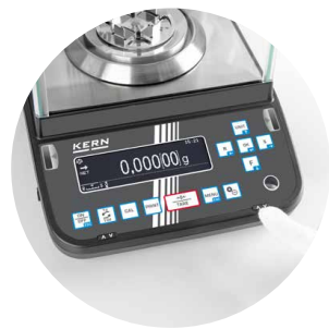
Opening possible alternatively via button