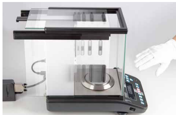
Automatic sliding doors, which can be opened and closed using sensors