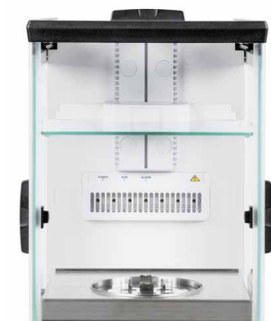
Internal draft shield – minimises the effect of air currents in the weighing chamber, only for 0.01 mg models of the series ABP-A