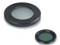
Simple polarising attachment