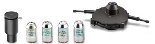
Quintuple PH universal rotary condenser with 10×/20×/40×/100× Infinity PH-Plan objectives (complete set, for OBN-15 included)