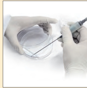
Coating of Petri dishes