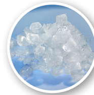
FM-8oKE-HCN Ice: Nugget