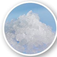
FM-8oKE-HC Ice: Flake