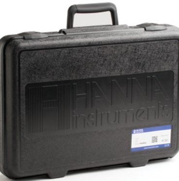
rugged carrying case with custom insert