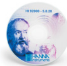
HI9298194 PC software