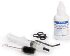
HI76981942 probe maintenance kit