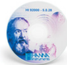
HI9298194 PC software