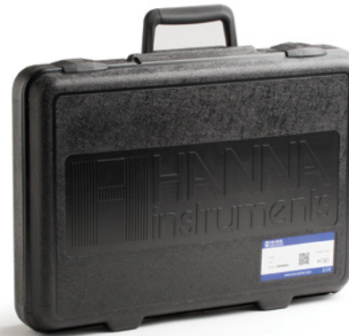
rugged carrying case with custom insert