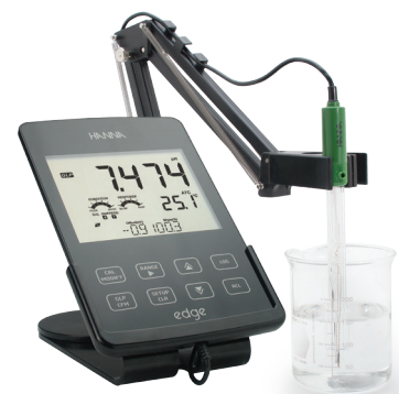
edge® multiparameter | EDGEMULTI