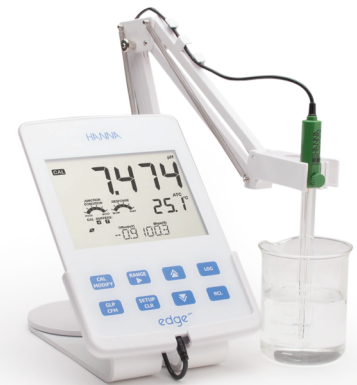
edge® pH hybrid meter | HI-2002-02