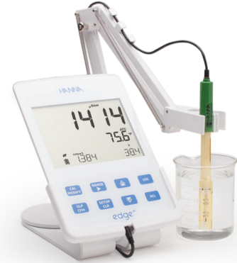
edge® EC hybrid meter | HI-2003-02