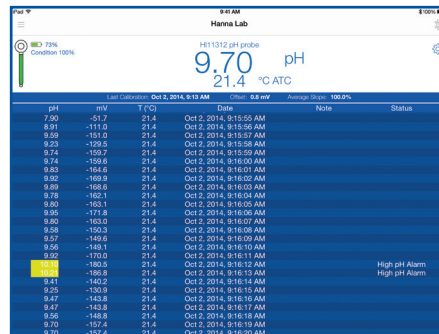
With tabulated data