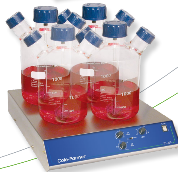
BS-200-4-5000 4 Position Biological Stirrer