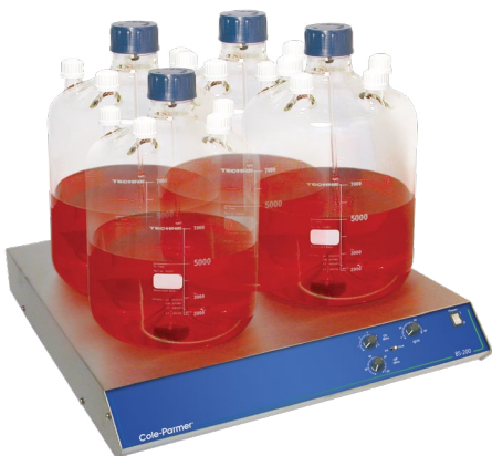
BS-200-4-5000 4 Position Biological Stirrer