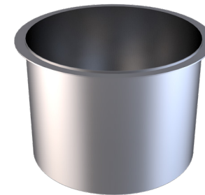
Cryogenic Processor Inner Bowl, 5 L