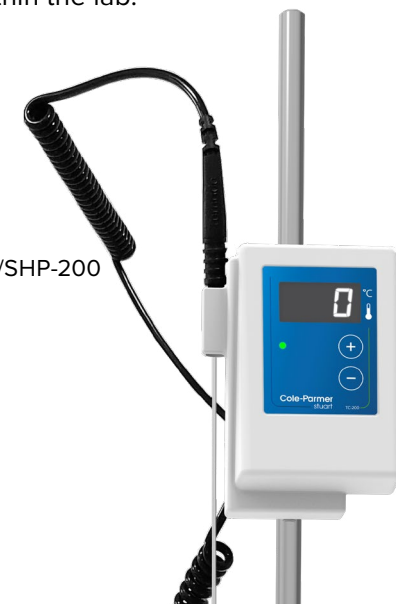
Temperature Controller HP-200/SHP-200

BioCote® utilises silver ion, copper, zinc and organic additives to provide built-in antimicrobial protection; so the Cole-Parmer Stuart range can support a safer and more hygienic laboratory environment. By reducing levels of bacteria, mould and fungi, your BioCote protected piece of equipment can help reduce the risk of cross-contamination and consequently disease transmission within the lab.