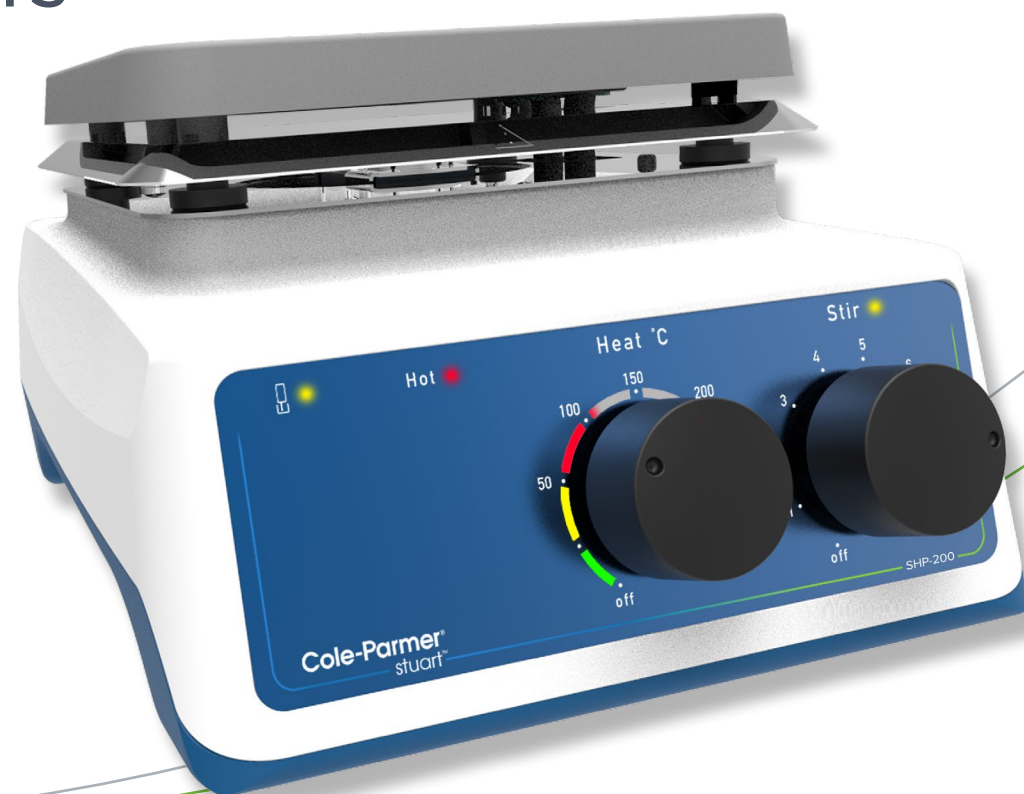
Hot Plate Stirrer SHP-200