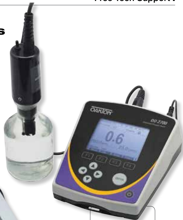
Water-resistant keypad and convenient pullout reference guide

DO 2700 includes: self-stirring dissolved oxygen/BOD probe 35420-82, six membrane caps and electrolyte, and 100/240 VAC power adapter.