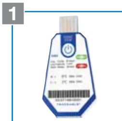
Set data logger