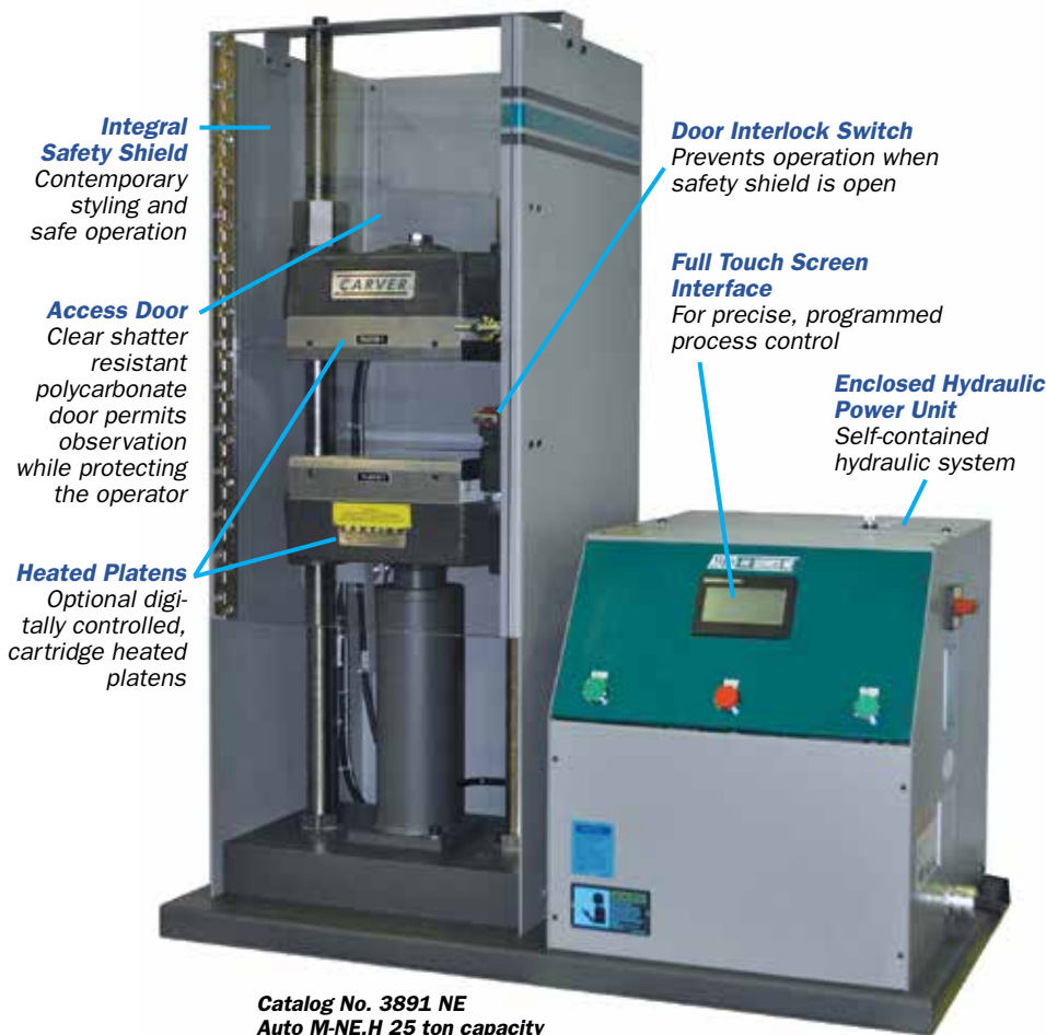
Catalog No. 3891 NE Auto M-NE,H 25 ton capacity