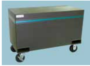
FLOOR STANDS – Designed for most vintage models