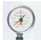
ANALOG GAUGES/ THERMOMETERS (See page 13)