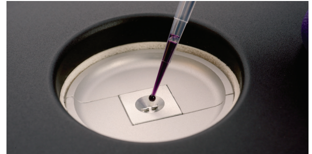
Micro-Volume Specifications of the BioDrop In-Built Sample Port

The in-built sample port uses no moving parts. This means that the instrument provides excellent reproducibility without the need to recondition or calibrate. Measurements are also highly accurate because the pathlength of the port is highly specified to \pm 5 \mu\text{m} . BioDrop also looks at the purity of your sample and flags up any issues you may need to address.