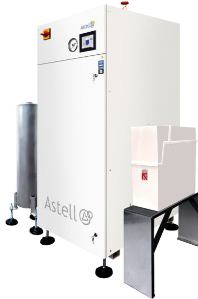
A typical STG072 with optional blowdown vessel (left) and water softener (right)