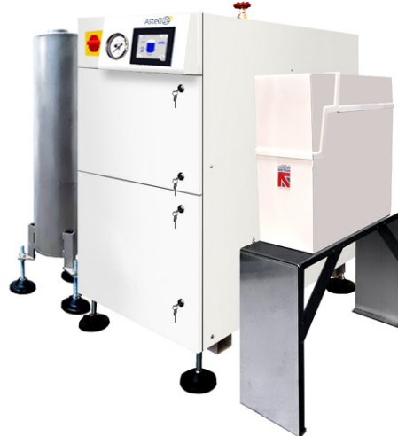
A typical STG024 with optional blowdown vessel (left) and water softener (right)